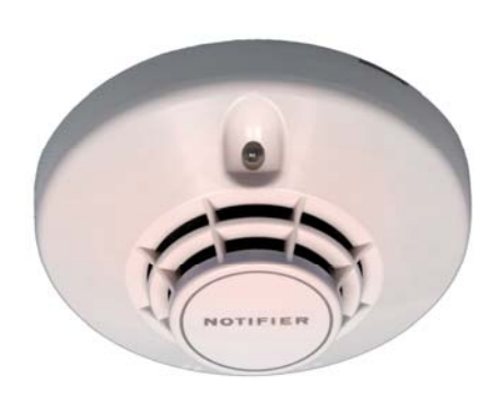
ND-751T-E Intelligent Plug-in Thermal Detector